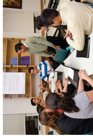
PathwayConnect gathering in Puebla, Mexico

Students gather once a week to participate in educational and leadership activities related to their courses, as well as receive support from peers. Gatherings are held at a church meetinghouse, an institute building, or virtually through online groups.